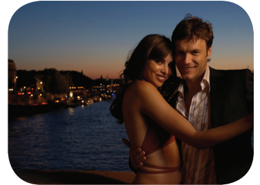
FUJIFILM SR AUTO

Available in all FinePix digital cameras that do not contain EXR Technology.