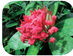
Conventional digital camera in Auto Mode

When your subject is closer than normal, SR AUTO automatically adjusts the FUJINON lens optics and aperture for a shallow depth of field, producing high-resolution close-ups with crisp clarity.