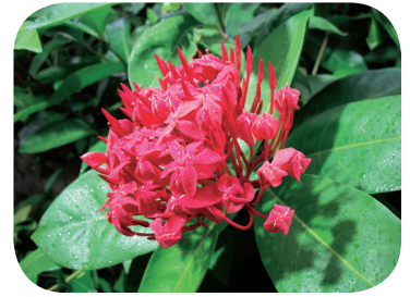
FUJIFILM SR AUTO