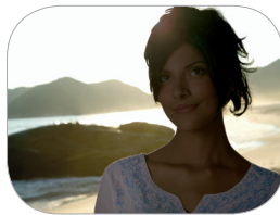
Conventional digital camera in Auto Mode (simulated image)

When photographing people against the sun or other strong backlight, SR AUTO automatically optimizes the exposure and flash to ensure clear, evenly lit facial features.