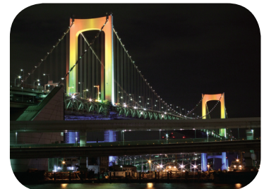
FUJIFILM SR AUTO