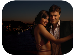
Conventional digital camera in Auto Mode (simulated image)

When photographing people at night or in low light, SR AUTO optimizes flash range, shutter speed and exposure to give you attractive, properly exposed portraits.