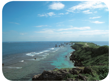
FUJIFILM SR AUTO

When SR AUTO detects a landscape, it automatically optimizes for maximum sharpness and depth of field. From cityscapes to nature, landscapes are captured in beautiful, high-resolution color and smooth tonality, just as the human eye sees them.