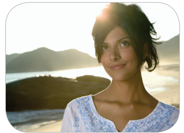
FUJIFILM SR AUTO